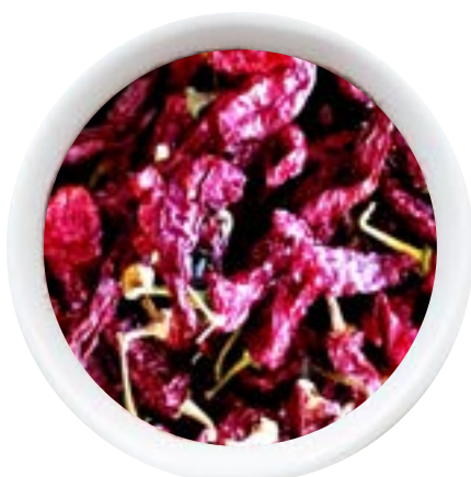
Kashmiri with Stem