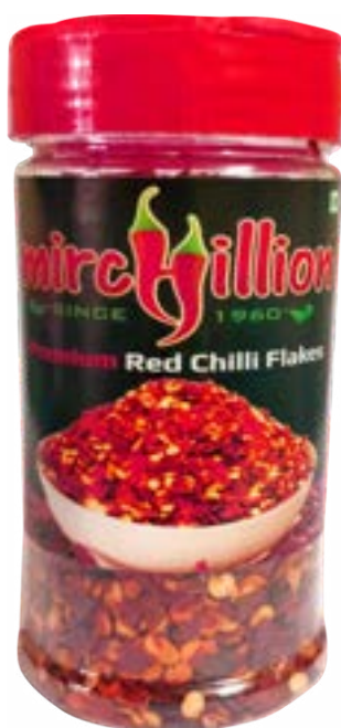
Red Chilli Flakes