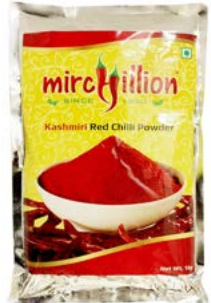
Kashmiri Chilli Powder