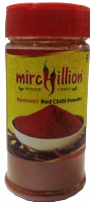
Kashmiri Chilli Powder