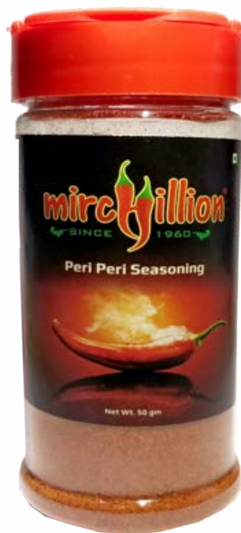
Peri Peri Seasoning