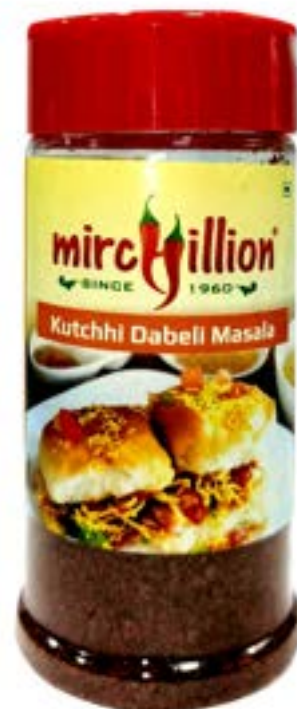
Kutchhi Dabeli Masala