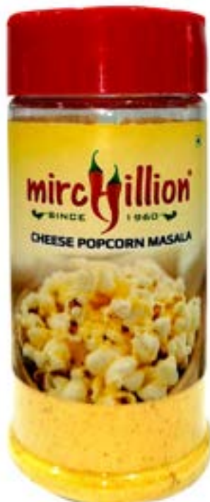
Cheese Popcorn Masala