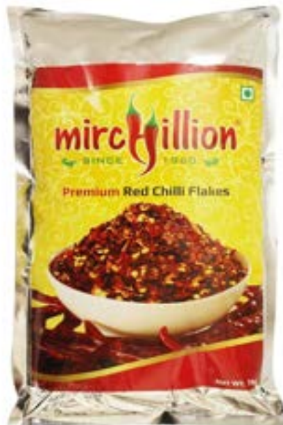
Red Chilli Flakes