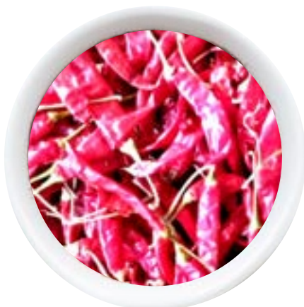
Teja with Stem