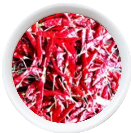
334 with Stem