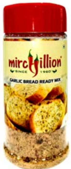
Garlic Bread Ready Mix